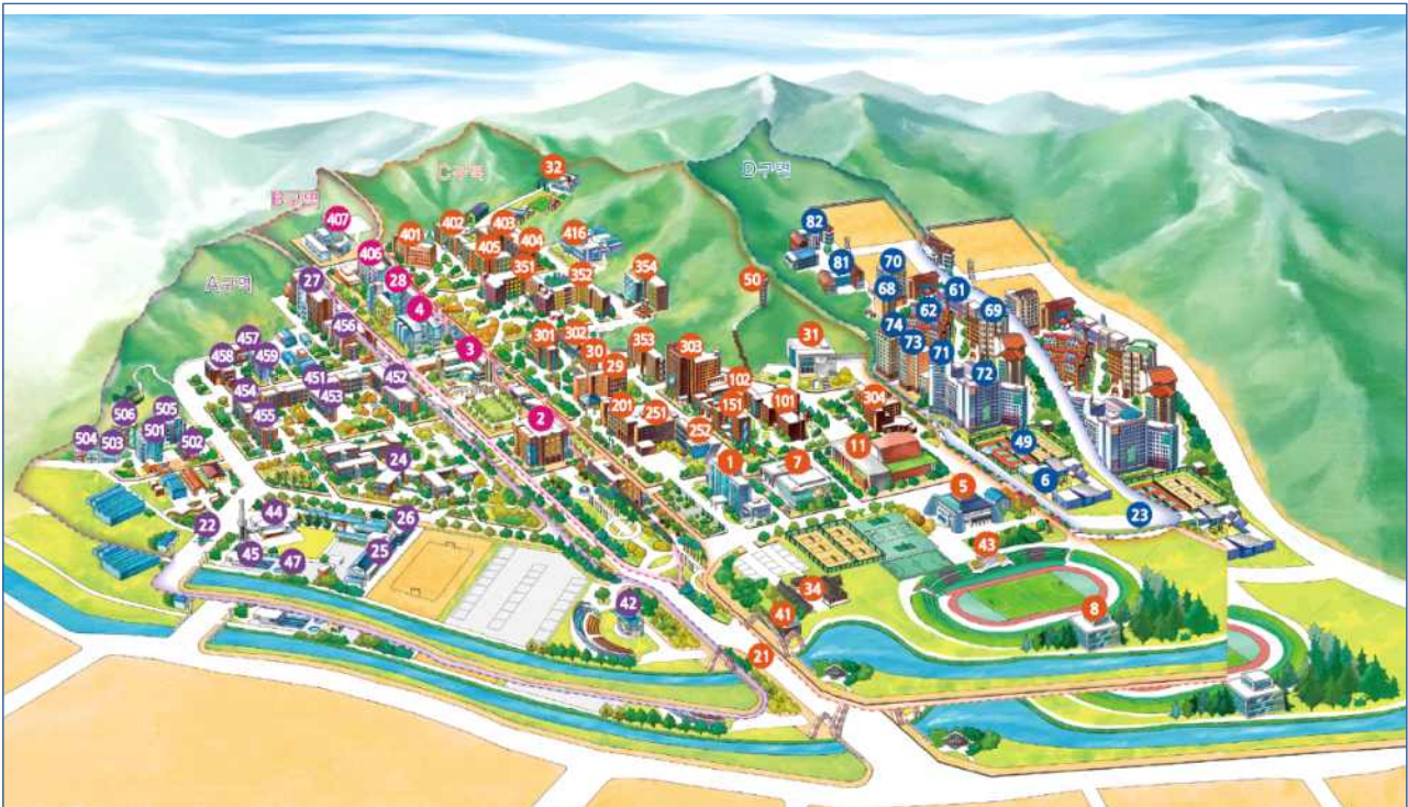
Gajwa Campus The hub for professional development in a premier industrial complex District A District B District C District D